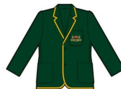
INDEX F - Edges only