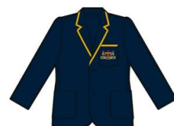
INDEX Z1 - Collar, lapels to top button & top pocket