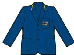
INDEX R - Collar Only