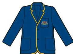
INDEX P - Collar & lapels to bottom of facing