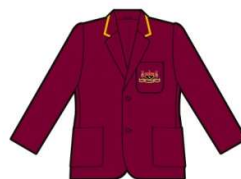
INDEX S - Collar only (with return to lapel seam)