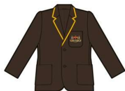
INDEX Z2 - Collar & lapels