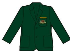
INDEX J - Chest Pocket